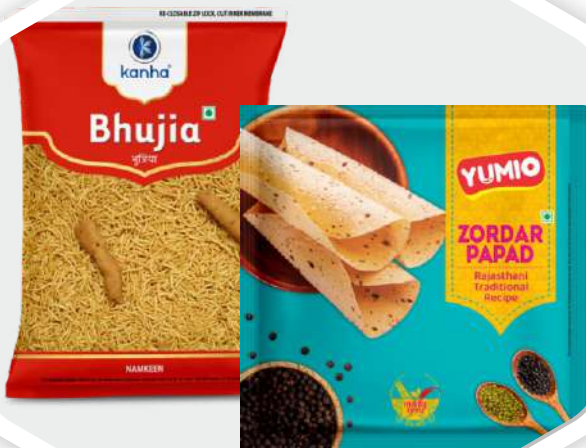
Papad | Bhujia