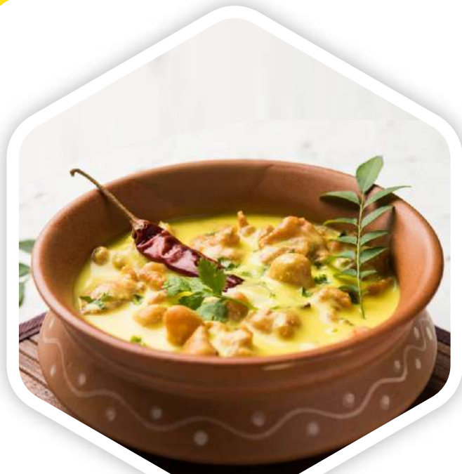
Rajasthani Kadhi Pakora