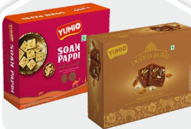
Dodha Burfi | Soan Papdi