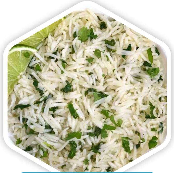
Cilantro & Lime Rice